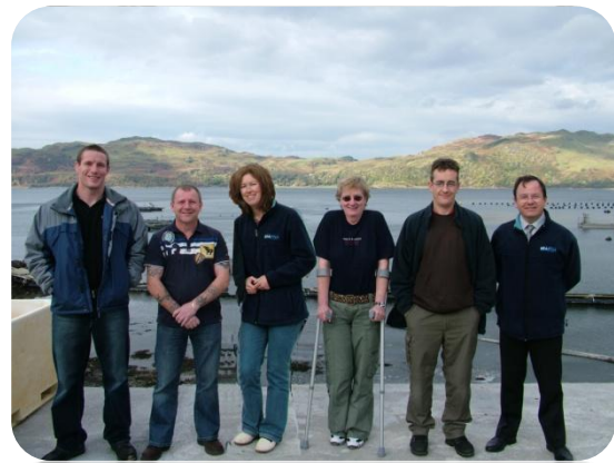
1st BVP Operations Course